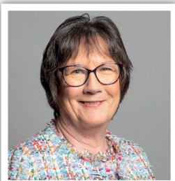
Pauline Latham OBE MP

MP for Mid Derbyshire www.paulinelatham.co.uk 01332 676679