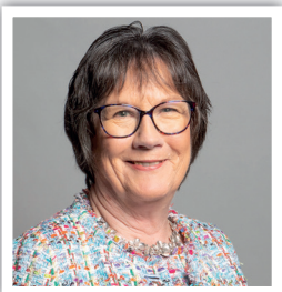
Pauline Latham OBE MP for Mid Derbyshire www.paulinelatham.co.uk 01332 676679